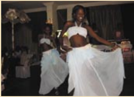
Eclipse dancers thrilled guests.

The Stanley hosted a very successful Marketers Night that featured team building activities, entertainment by renowned artists and a sumptuous dinner. This was one of the now popular themed nights that are both cultural and professional.